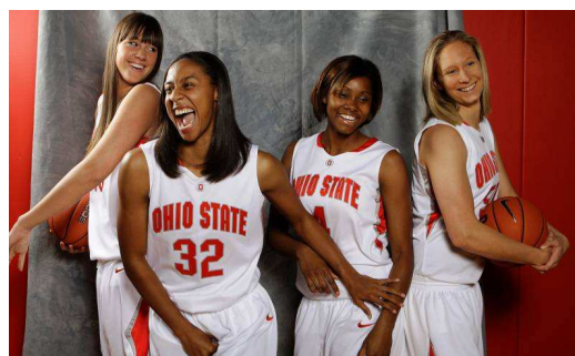
THE FOUR FRESHMEN